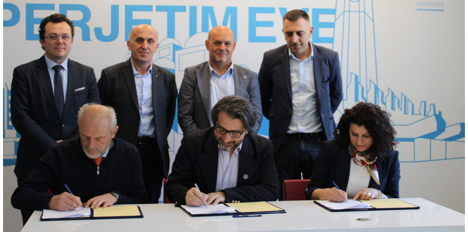
Sining the agreement for the plot of Proffessional Medical Chambers

General Hospitals in Gjilan and Prizren. This program is designed in accordance with the human resources management plan of the two hospitals for the 2022-2026 period. Through the training provided, the doctors of these two hospitals will have the opportunity to advance their professional skills and knowledge. This initiative will help increase the quality of healthcare and progress