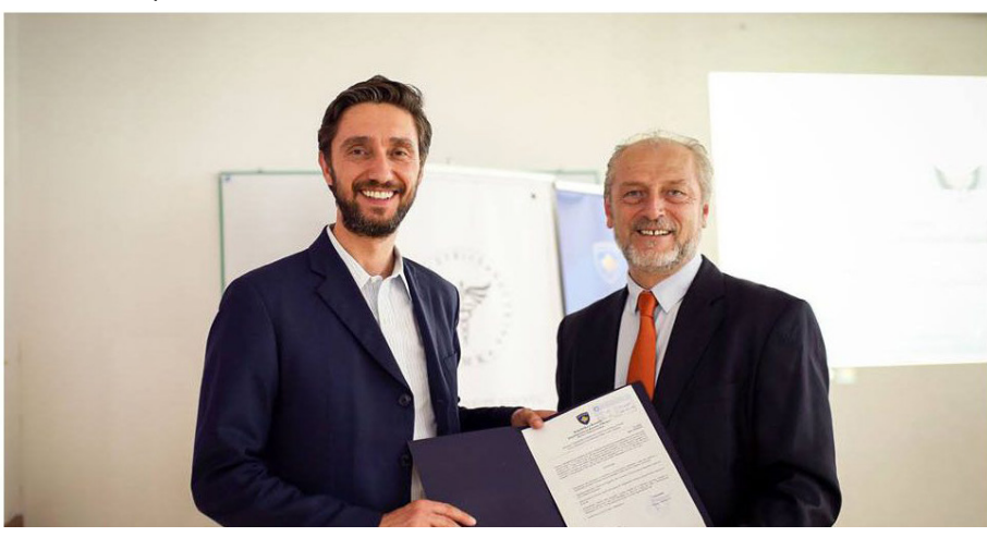
Competences transfered from the Ministry of Health to Kosovo Doctors Chamber

However, due to the failure to initiate the membership process for doctors and, also, due to the lack of key powers guaranteed by law for the Chambers of Health Professionals, during the first mandate the Kosovo Doctors Chamber was unable to ensure functional and financial independence and stability.