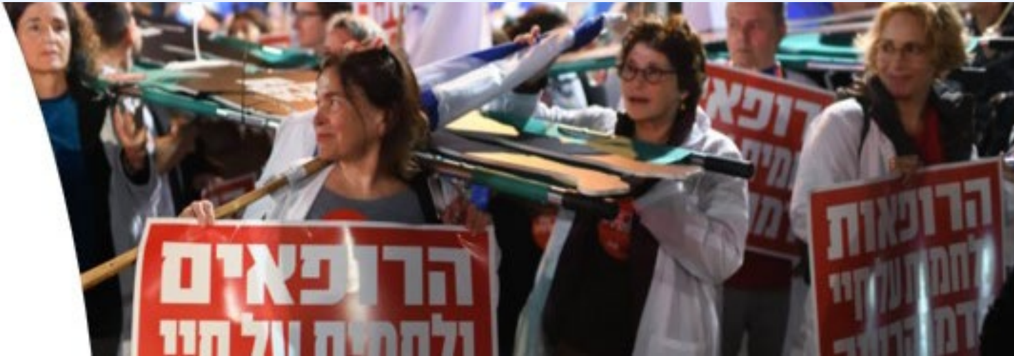
Doctors demonstrating in Israel.